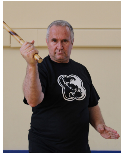
Cube Matrix Combination 6-3-10 Serrada Planchada Doblete Abierta Basbas Hudás Serrada De Cuerdas Abajo Sima