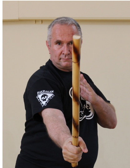
Cube Matrix Combination 8-10-5 Serrada Salok Saboy Serrada De Cuerdas Abajo Sima Abierta Planchada Doblete